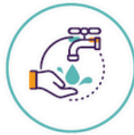
CLEAN HANDS OFTEN