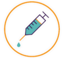
GET YOUR RECOMMENDED VACCINATIONS

Vaccinations remain the best defence against COVID-19 and influenza.