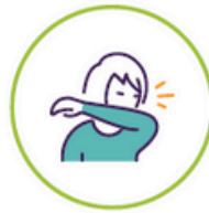
COVER COUGHS AND SNEEZES