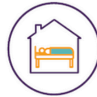
STAY HOME WHEN ILL