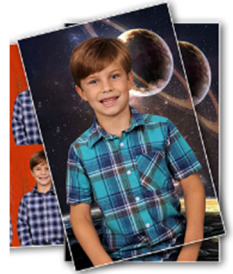
Photo orders have arrived at the school for those that have ordered prints from the initial photo day. Photo retake day will take place on October 25 th for families that did not like the individual picture or missed photo day. We will send a reminder about retakes a few days before they begin.