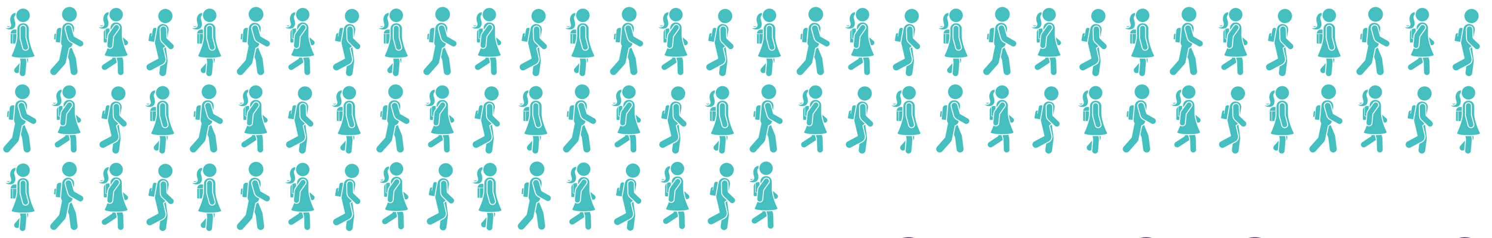
= 1,000 students

+81,000 STUDENTS ENROLLED IN THE DISTRICT