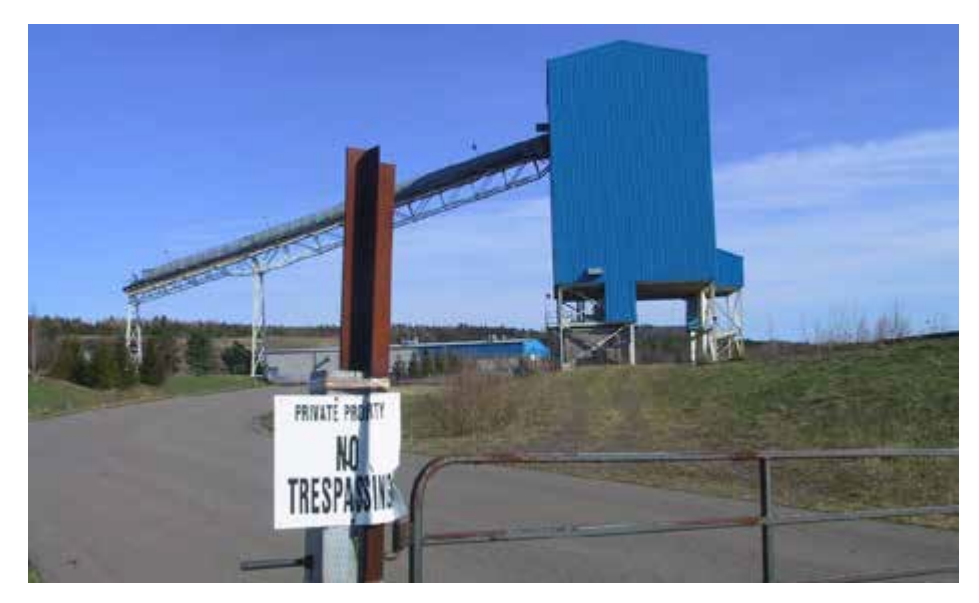
Westray mine site, Plymouth Nova Scotia