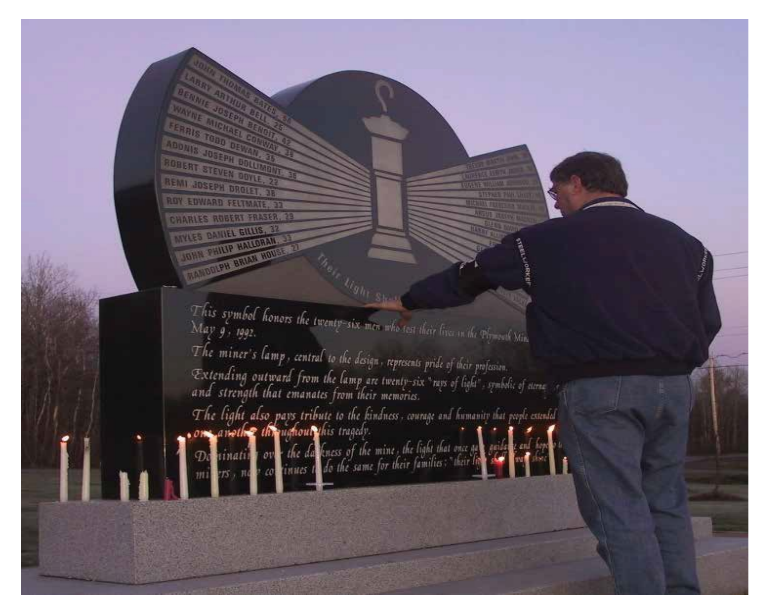
Westray Miners Memorial Park monument, New Glasgow, Nova Scotia