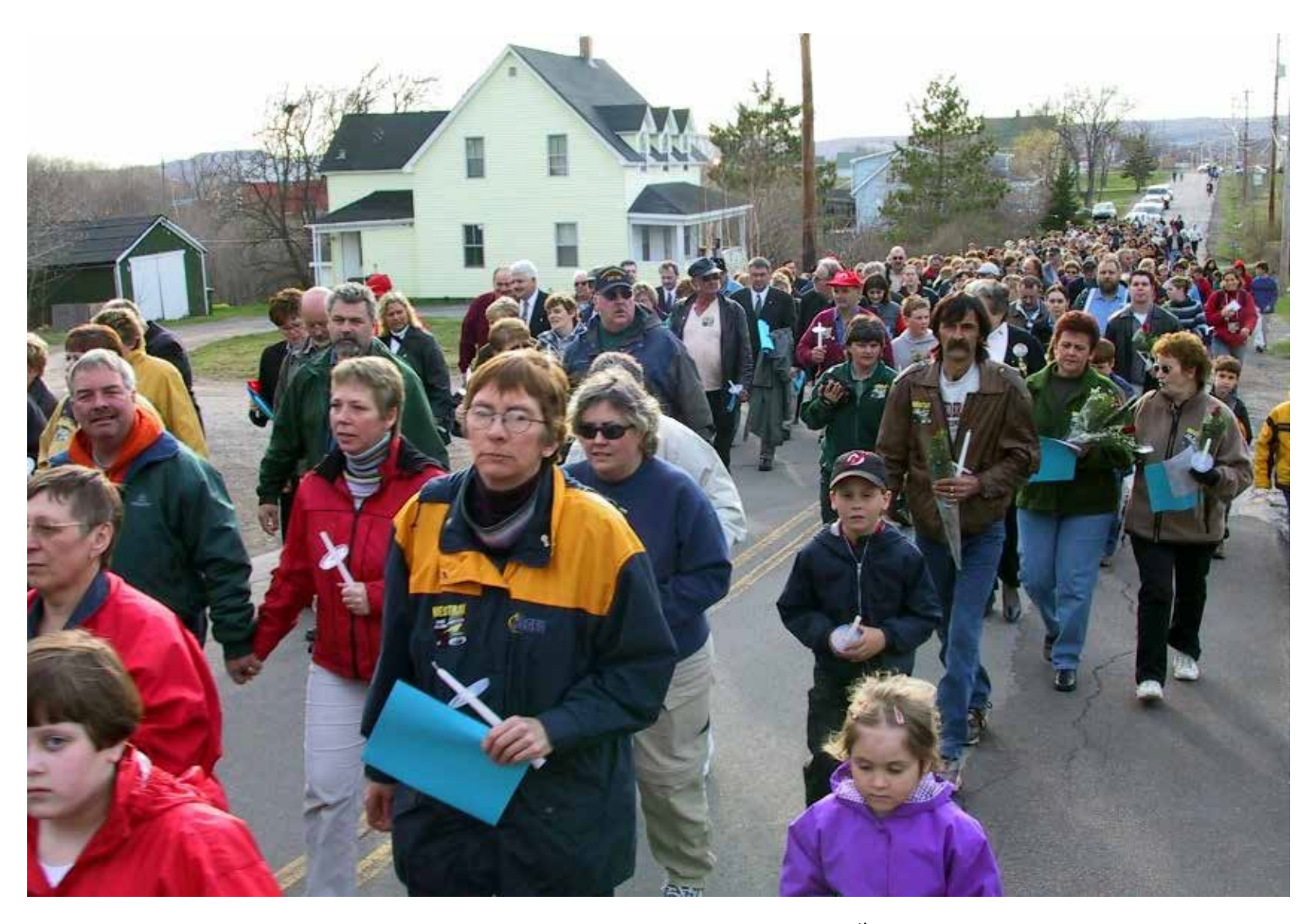
Procession to honour the Westray miners in 2012, the 20th anniversary of the explosion