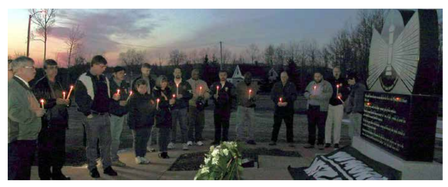
Their lights will shine gathering at the Westray Miners Memorial