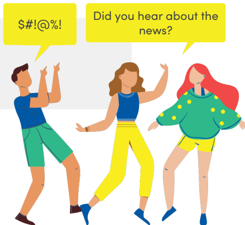
Change the subject