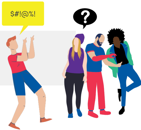
Give a questioning glance