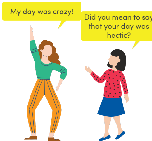
Repeat what you heard without the discriminatory language