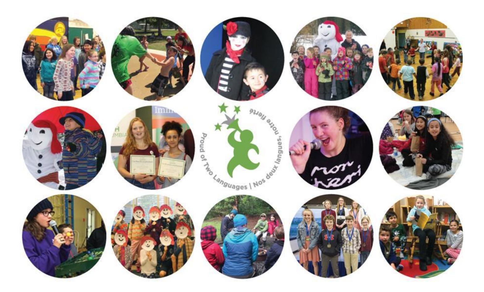
Support your local CPF chapter and French Second Language education in your community by joining/renewing your CPF membership!

Don't forget, from now until October 31st, 90% of your membership fee goes straight back to your local chapter! There are great prizes to be won as well! Join or renew here .