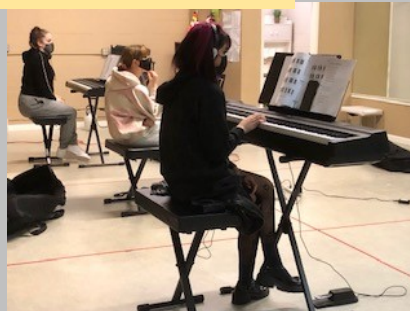
MUSIC SAMPLER COHORT