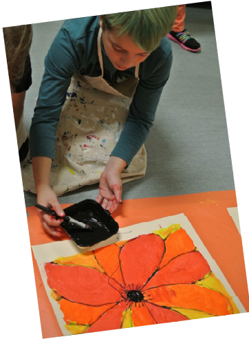
Primary Art Club