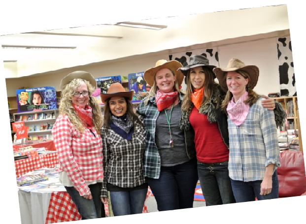
Teachers saddling up for the Book Fair!