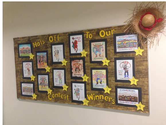
Hats Off to our Contest Winners!