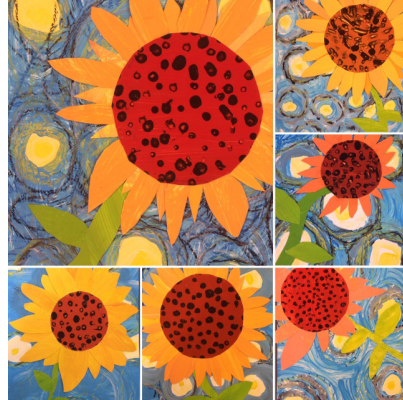
Beautiful Sunflowers from Primary Art Club