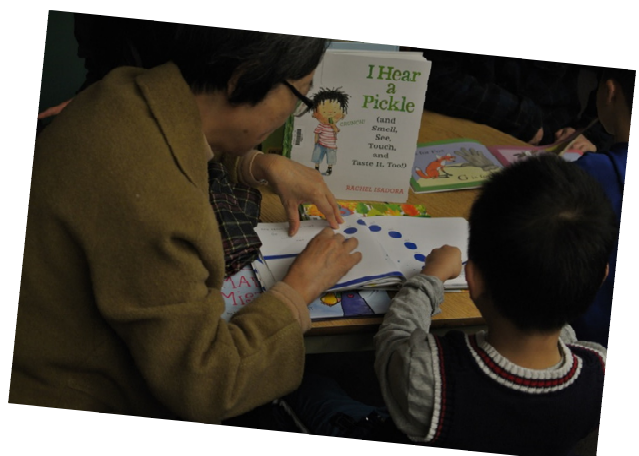
Family Reading in Grade K/1