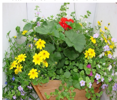
14" Rattan Basket with Mixed Plants