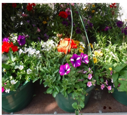
12" Mixed Plants with Plastic Basket