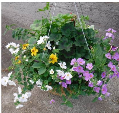
14" Moss Basket with Mixed Plants