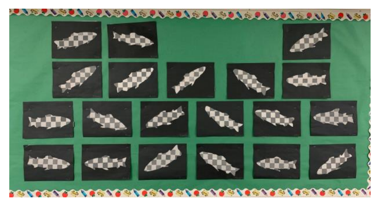
5 - Divison 24 Mme Kell