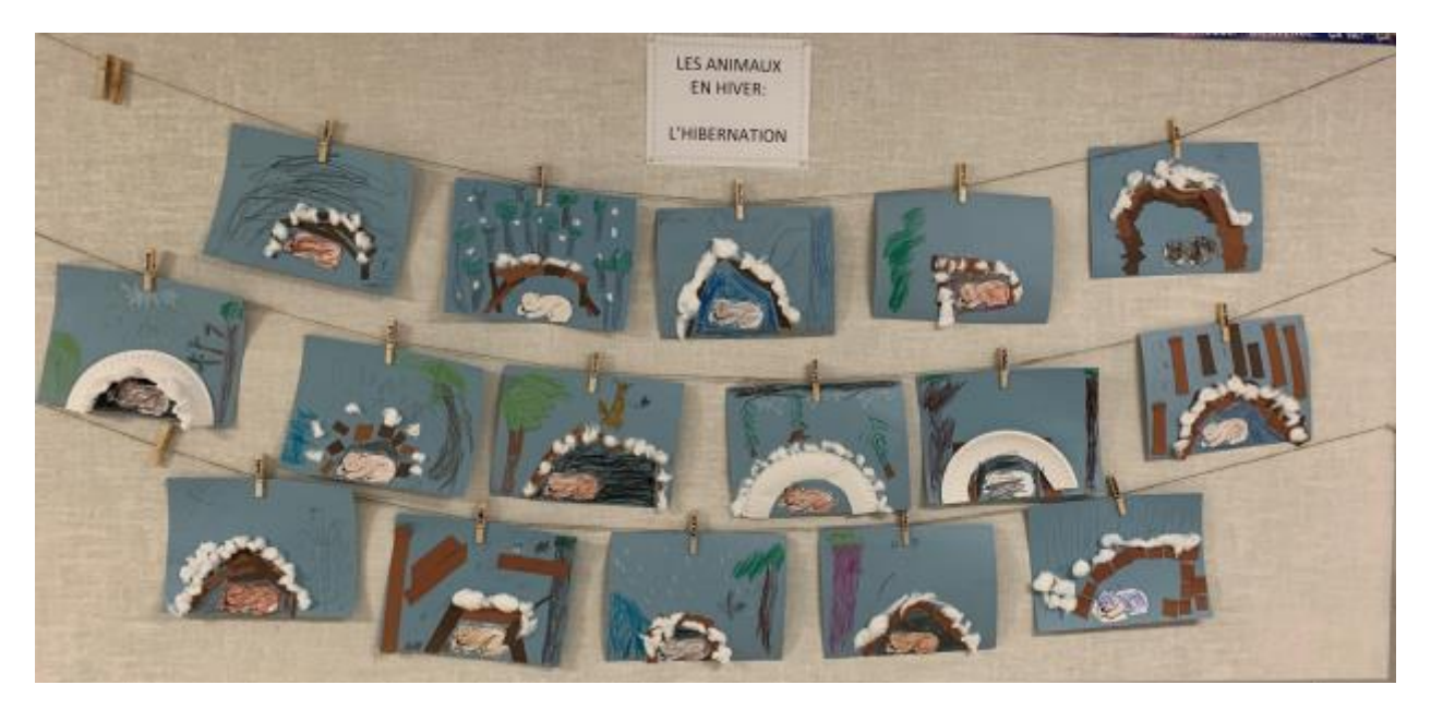
7 - Division 26 Mme Landry