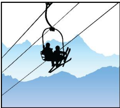
Reach New Heights