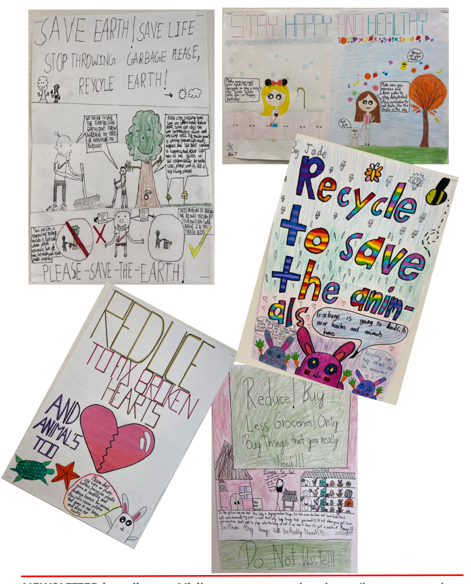
NEWSLETTER is online.....Visit www.surreyschools.ca/beavercreek