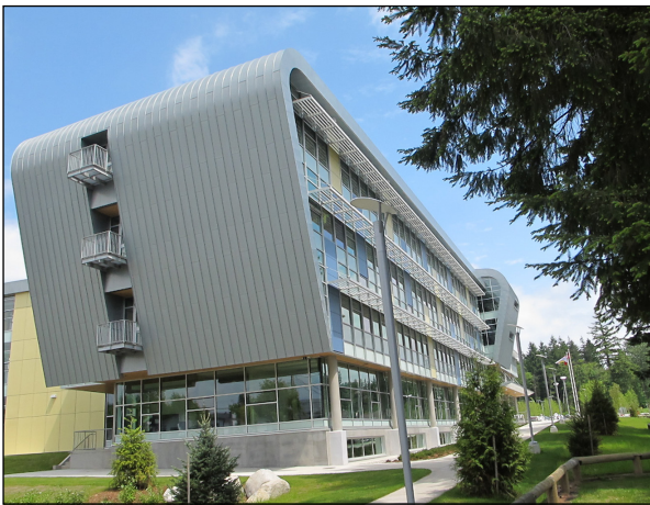
The LEED-Gold-designed District Education Centre.

A new 11,650 square metre District Education Centre (DEC) was completed with full occupancy by nearly 500 administrative and support staff, teachers and students. Built to LEED Gold standards, this innovatively designed and constructed community-accessible building significantly reduces the district's carbon footprint.