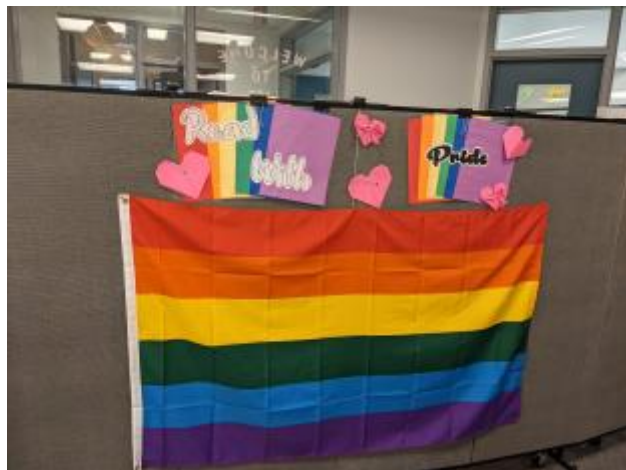
2 - Forsyth Road Pride Flag