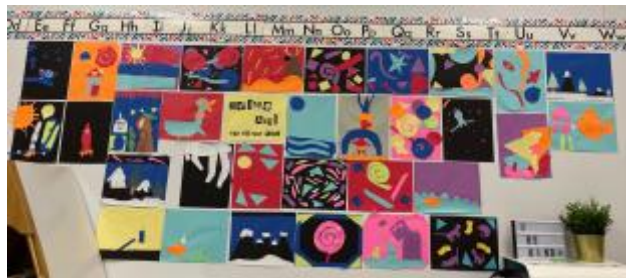
1 - Library Matisse