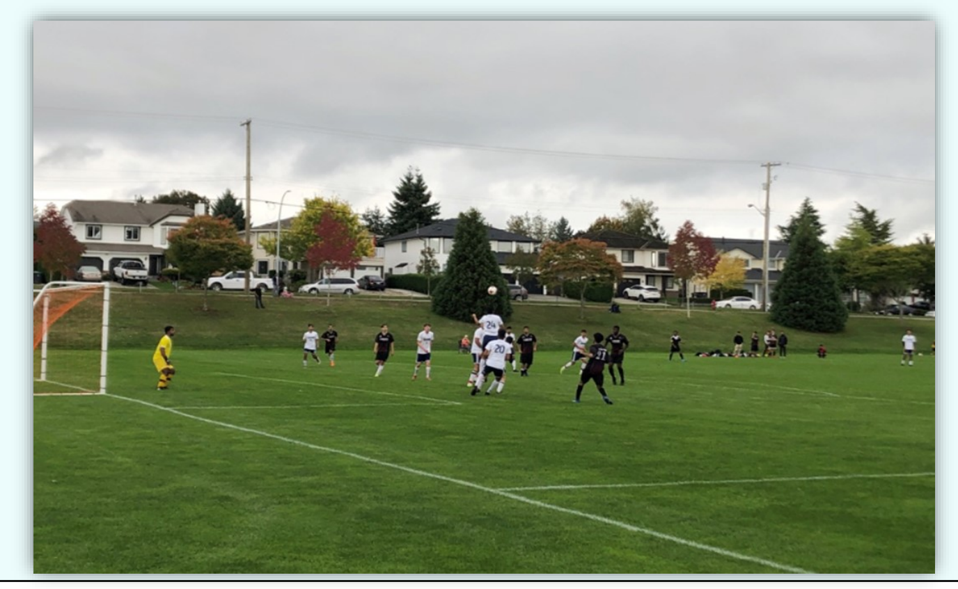
Home of Dragon Pride "Building Successful Futures"