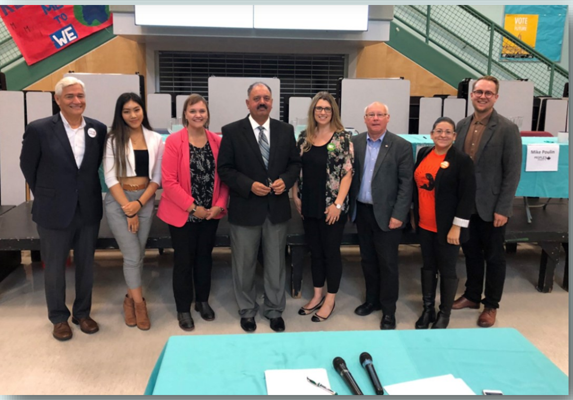
Home of Dragon Pride "Building Successful Futures"