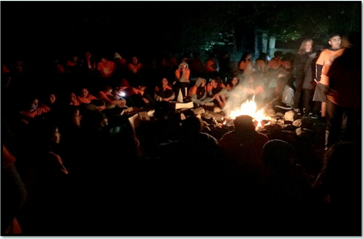
Home of Dragon Pride "Building Successful Futures"