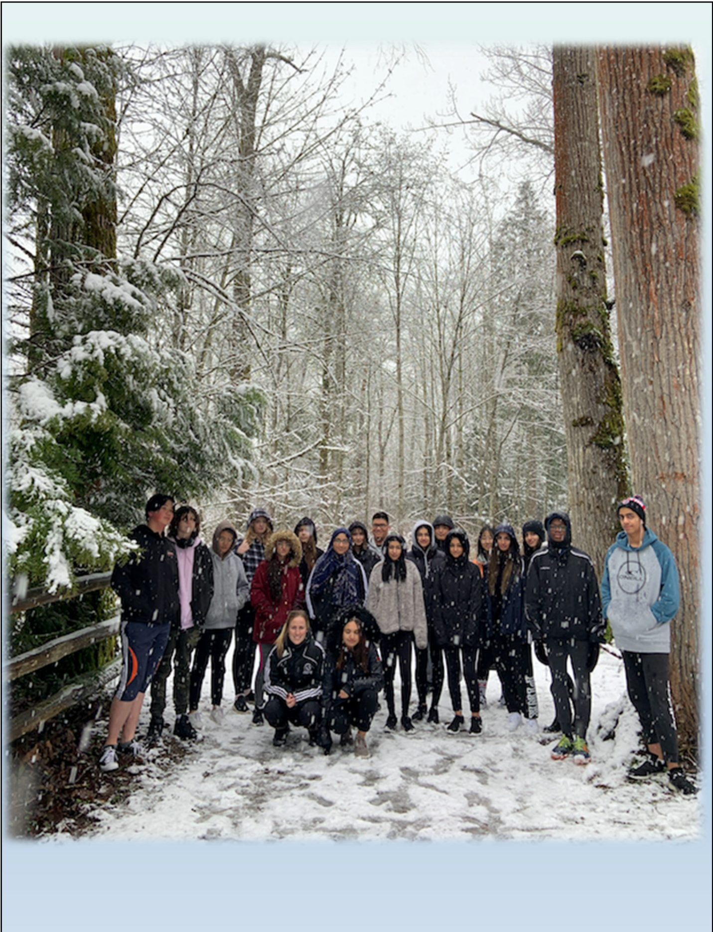
Home of Dragon Pride "Building Successful Futures"