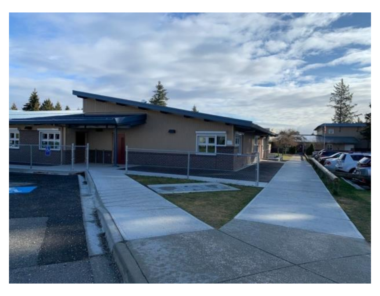
Frost Road November 2021 Newsletter