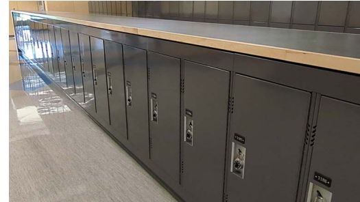
Example of Lower Locker Sections

~ EVEN Numbers are UPPER lockers ~ ODD Numbers are LOWER lockers (unless otherwise stated)