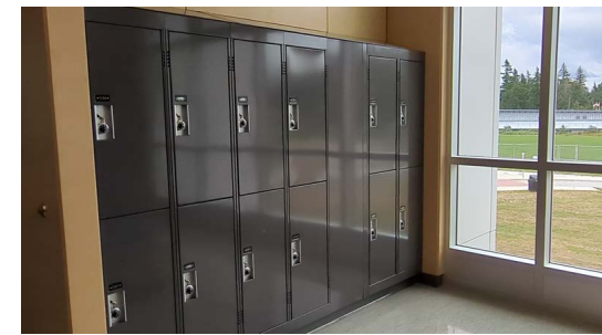
Example of Normal Locker Sections

~ EVEN Numbers are UPPER lockers ~ ODD Numbers are LOWER lockers (unless otherwise stated)