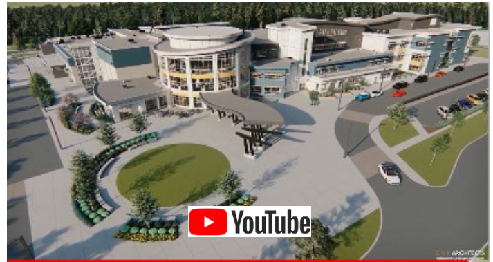
Grandview Heights Secondary School | CHP Architects Station One Architects

If you have not had a peek at our school's virtual fly through video, simply click on the rendering image to view the YouTube video.