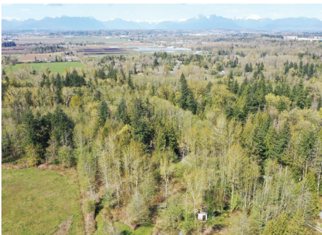
Site 208 17950 25th Avenue*