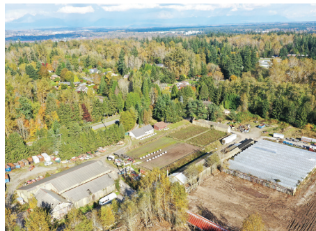
Site 214 17390 20th Avenue*