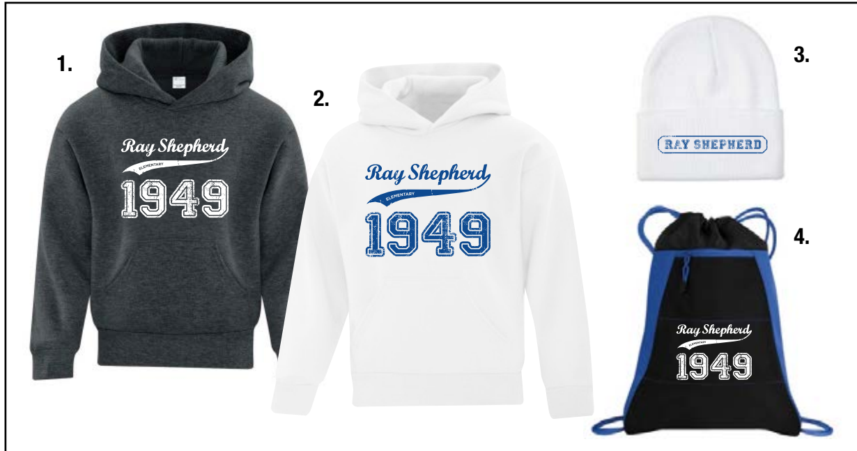
EVERYDAY HOODIES - ADULT & YOUTH 50/50 COTTON/POLYESTER FLEECE