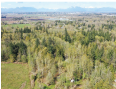
Site 208 17950 25th Avenue*