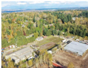
Site 214 17390 20th Avenue*