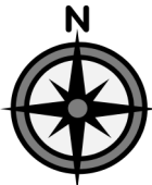
James Ardiel Elementary School Map