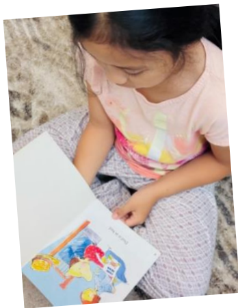
Crystal loving her reading!