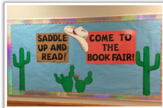
Our teachers and our library get fully stocked with the latest titles from the proceeds of our book fairs. And it is by far one of the most popular events at Rosemary!

Covid Care Fund: This position works with the administration and Treasurer to identify needs within our school community. Fundraiser will also be in these discussions to ensure these needs are being met.