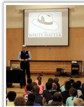
The White Hatter provides parents and students the knowledge and tools to be safe online. The PAC organized presentations for parents and all the grade 6/7 classes this year.