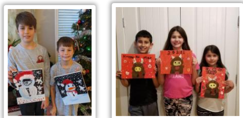
Our 2 Virtual Paint Nights were a huge success with 90 kids online with us creating away!

COMMITTEE OFFICERS: (if needed, one PAC meeting a month, monthly check-in with Exec member, and available via email or text. All of these positions will have Exec support)