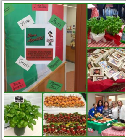
We go all out for our Staff Appreciation Lunches. Each year comes with it a different cultural theme and incredible food!