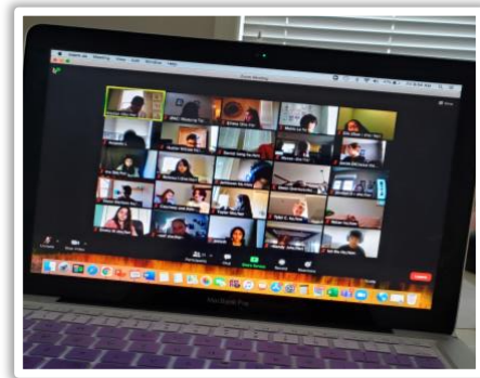
Stay Safe and Babysitter's Courses Online

Also, through your generous fundraising efforts we have been able to help fund a brand-new community garden for our sister school, James Ardiel. We have donated 5100+ masks to youth in need in North Surrey, $1200 has gone to support families in Rosemary who have been impacted by Covid and $900 was raised to create a memorable Christmas for some of our families. The number of toys we donated through our toy drive was incredible. And 105 seniors received Valentine's Day cards from your kids this year. AND... we were even able to upgrade 20 of our laptops.