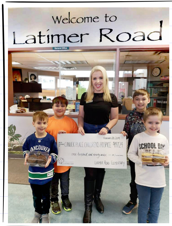
A representative from Canuck Place stopped by Feb. 28th for a cheque presentation photo op with some Latimer Students.