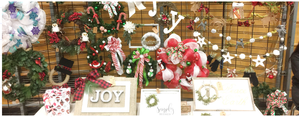
Holiday Items at the 2017 Latimer Road Craft Fair.