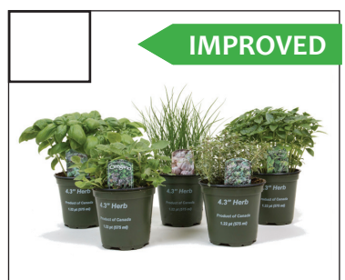
10-pack 4" Herbs

Fast-growing in popularity, succulents are versatile & low maintenance. Ideal as house decor and gifts! This 10-pack offers excellent variety and textures from the echeveria, sedum, sedeveria and senecio families. Duplicates & substitutes may occur.