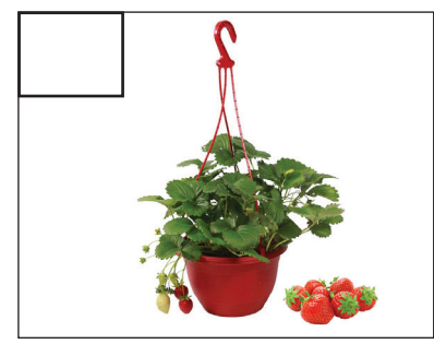
12" Strawberry Basket

All planters include an assortment of our top performing plant collections. Planters can be exposed to full sun areas. Perfect for creating a spring patio or backyard paradise.