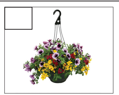
12" Premium Hanging Baskets

Our improved flower mixes are sure to be a big hit! These hanging baskets can be exposed to full sun with the best flowering and trailing plants. There are a variety of mixes/ colours.