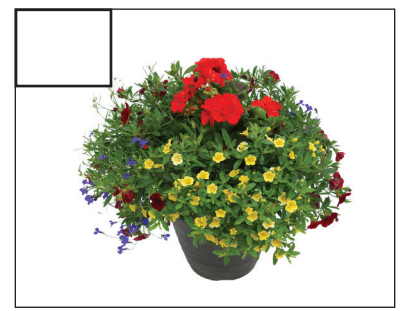
12" Premium Patio Planters

Our improved flower mixes are sure to be a big hit! These hanging baskets can be exposed to full sun with the best flowering and trailing plants. There are a variety of mixes/ colours.