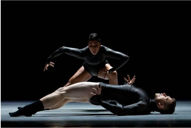
Ballet BC- Queen Elizabeth Theatre