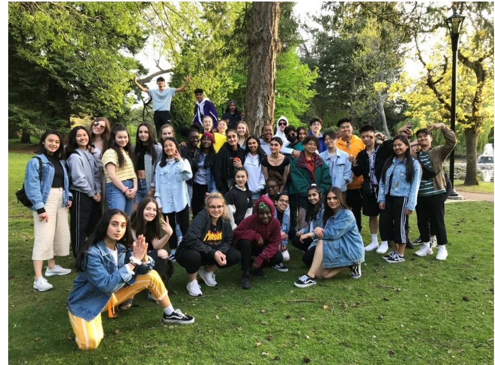
Make life long memories!