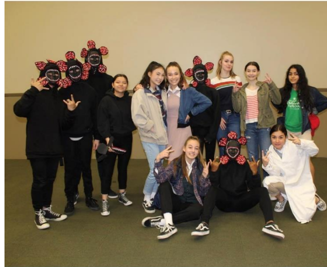
Surrey Arts Festival- Bell Centre