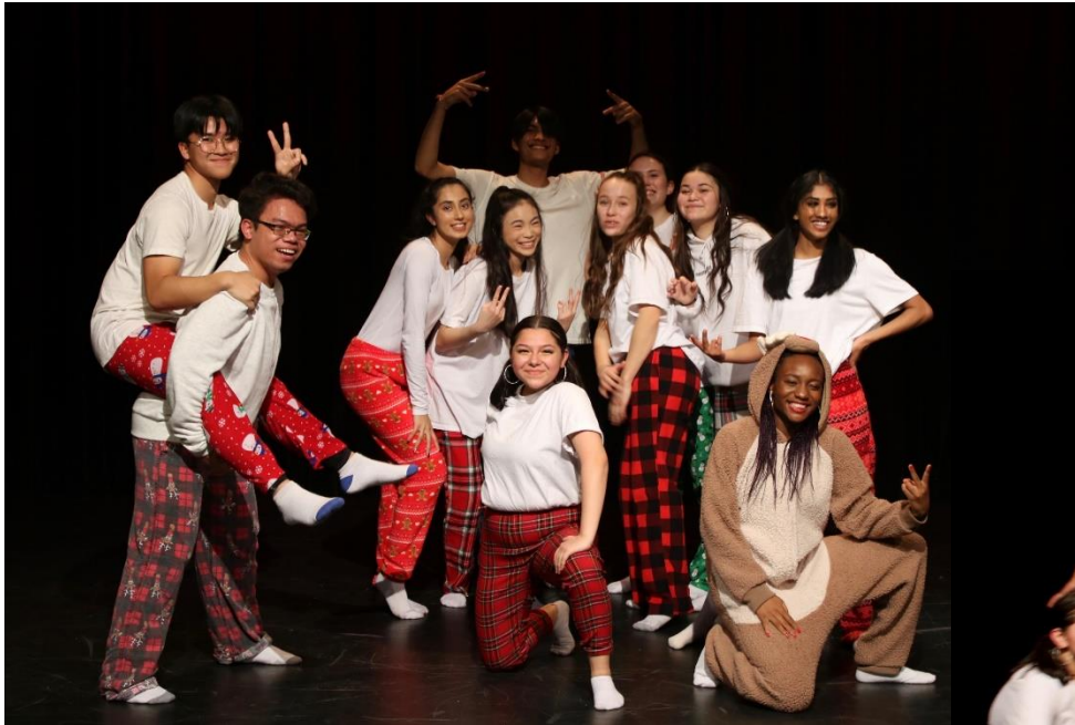
Junior and Senior Hip Hop Team