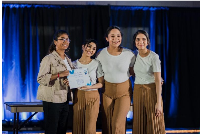
Breakout Dance Competition