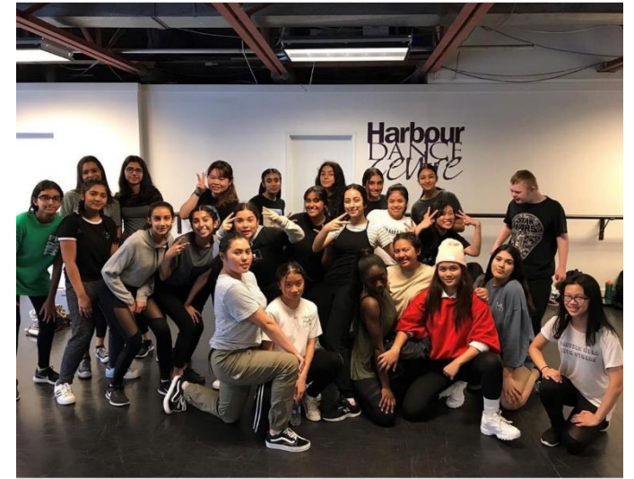
Harbour Dance Centre- Vancouver