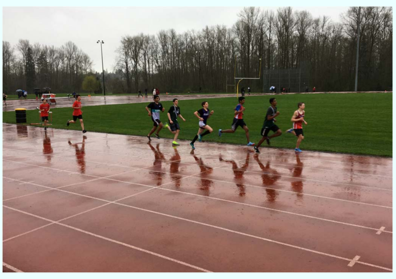
Home of Dragon Pride "Building Successful Futures"