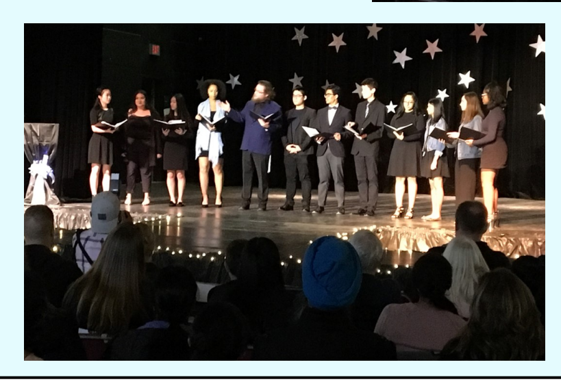
Home of Dragon Pride "Building Successful Futures"