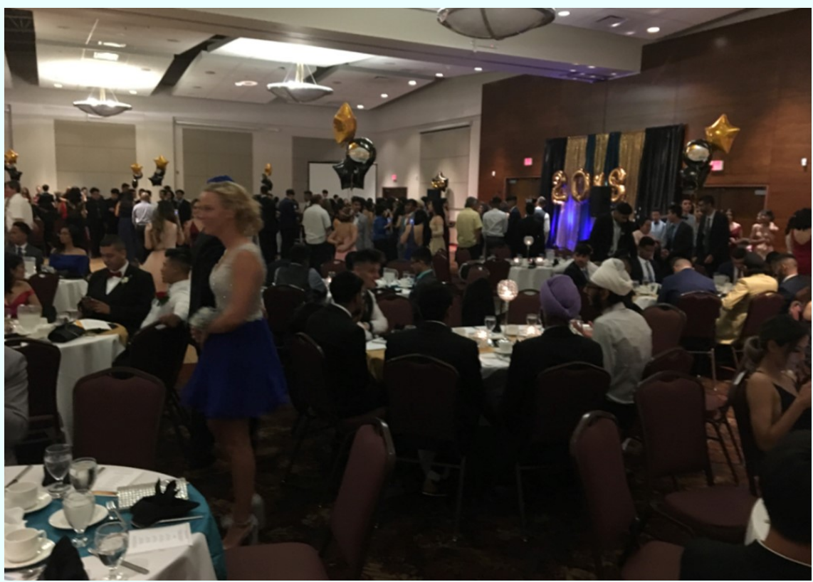
Home of Dragon Pride "Building Successful Futures"