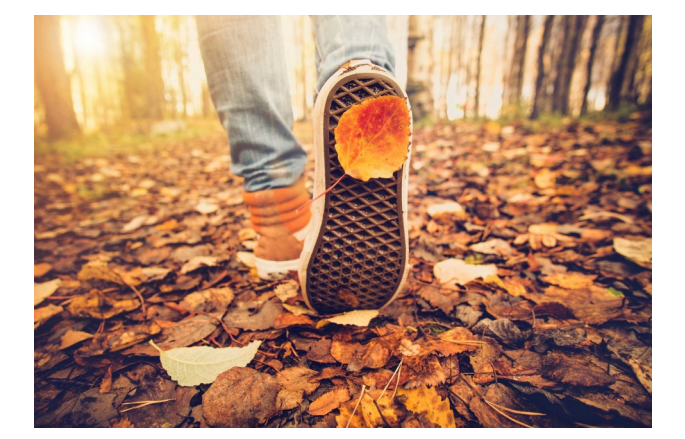
Home of Dragon Pride "Building Successful Futures"