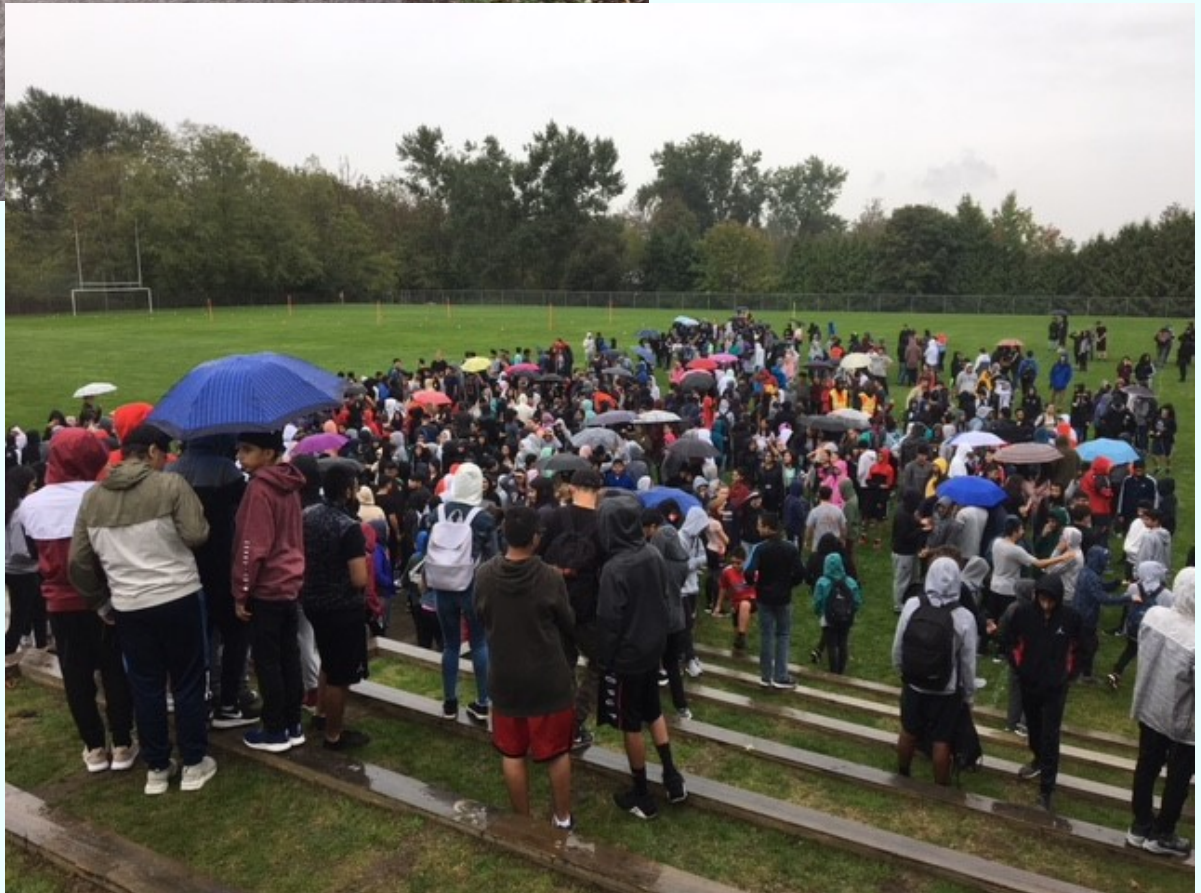
Home of Dragon Pride “Building Successful Futures”