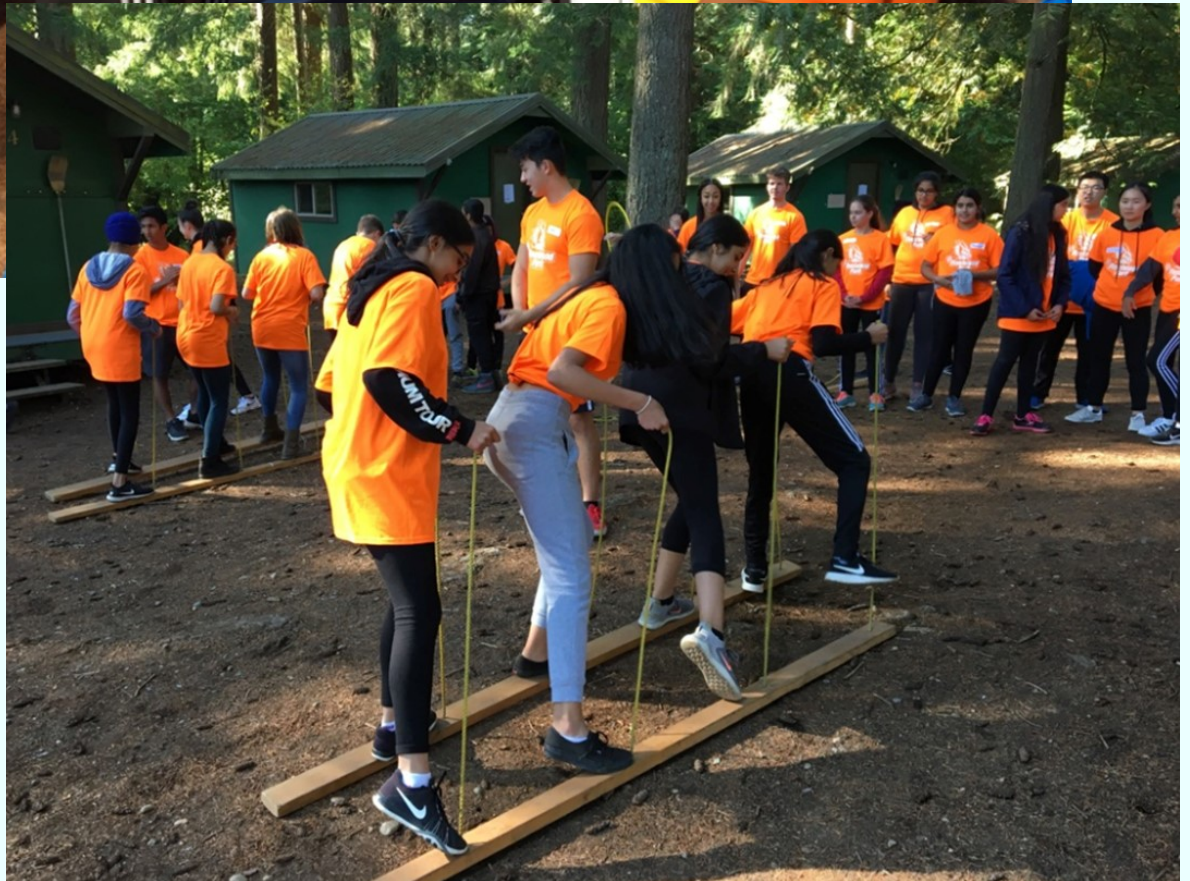
Home of Dragon Pride "Building Successful Futures"