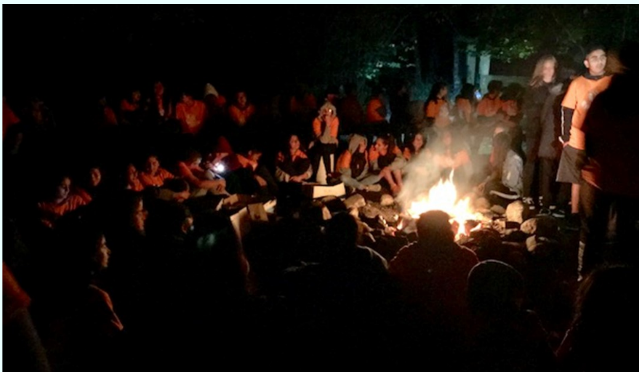
Home of Dragon Pride "Building Successful Futures"