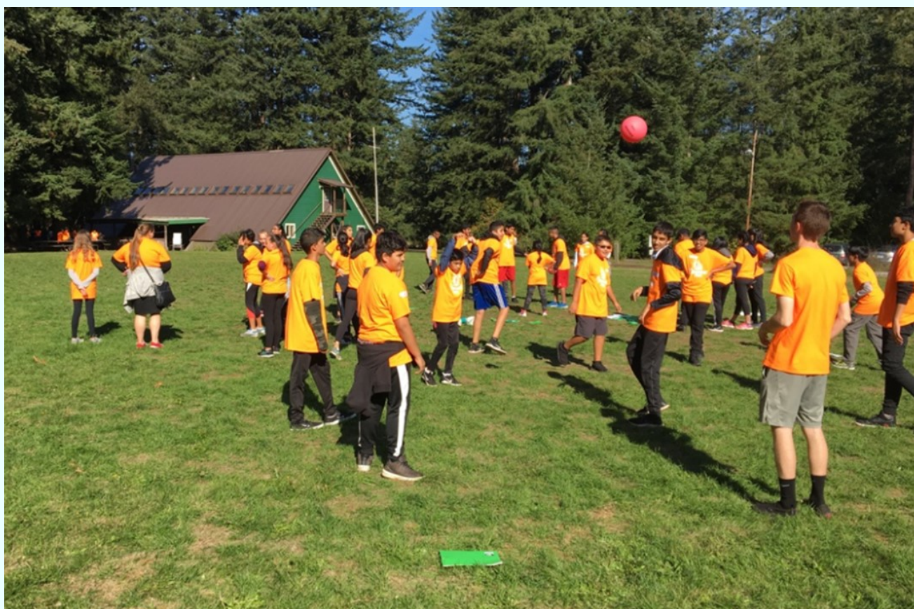
Home of Dragon Pride "Building Successful Futures"