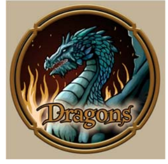
Home of Dragon Pride "Building Successful Futures"

"At Fleetwood Park Secondary we value excellence in education and strive to provide a learning environment where all students are encouraged to build successful futures."