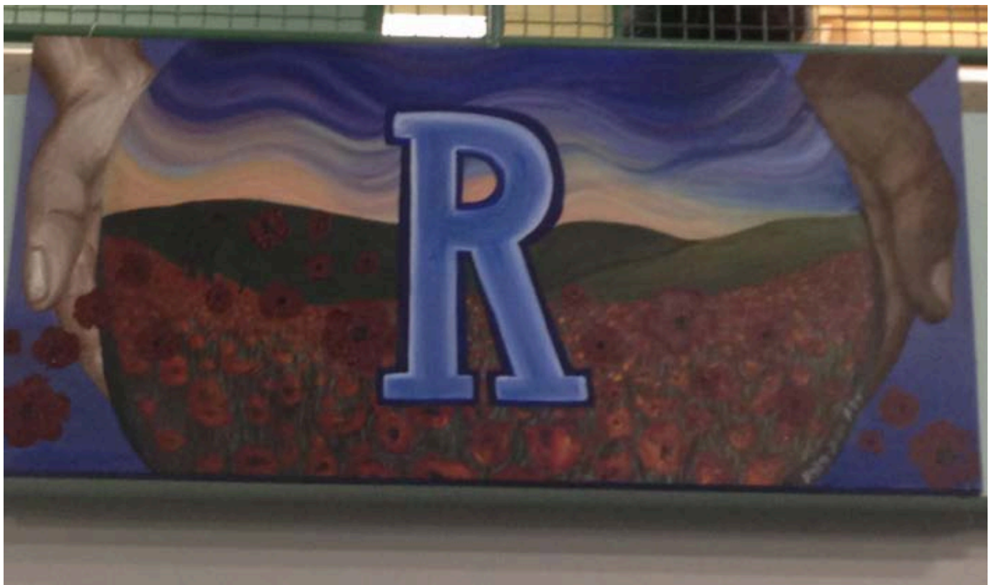
Home of Dragon Pride “Building Successful Futures”