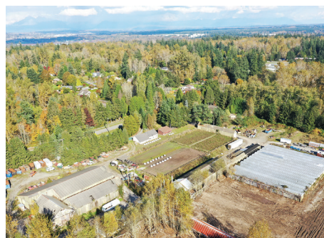
Site 214 17390 20th Avenue*