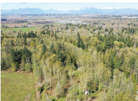
Site 208 17950 25th Avenue*