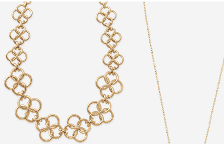
Crosby Link Necklace $69 $138

Maybe her style is a touch sparkle and a whole 'lotta edge. Match the gifts to the persona!