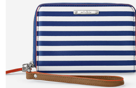
Chelsea Tech Wallet $32 $64