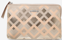
Capri Pouch $19.50 $39