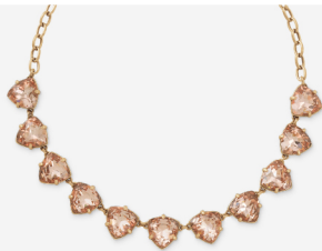
Somervell Necklace $32 $64