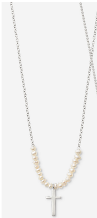
Mini Pearl Cross Necklace $27 $54