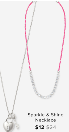
Sparkle & Shine Necklace $12 $24