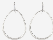
Goddess Teardrop Earrings $19.50 $39