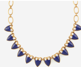
Lottie Necklace $27 $54