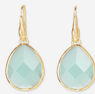
Amity Drops $19.50 $39