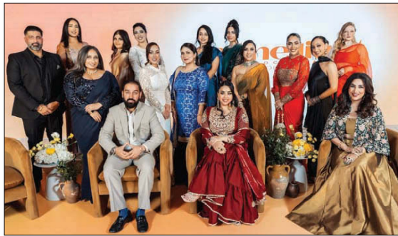
Be The Light gala-goers at Fairmont Pacific Rim in Vancouver on Nov. 18, 2025.

By awarding 62 scholarships in four years, the society celebrates "not only