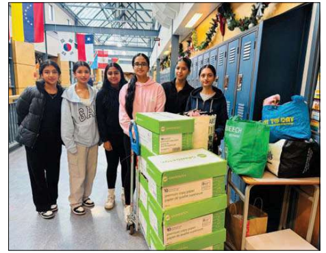
L.A. Matheson Secondary has hosted its annual Holiday Angel Tree Drive since 2010. The school's Punjabi classes gathered donations for the Surrey Women's Centre.

• L.A. Matheson Secondary's Punjabi classes hosted the school's annual Holiday Angel Tree Drive for the Surrey Women's Centre, collecting essential items and toys for care packages for women and