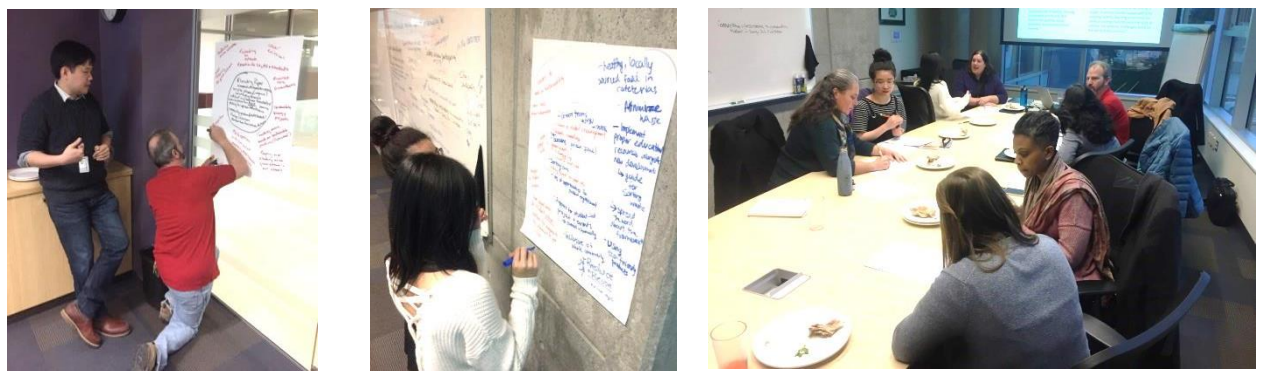
November SWG Meeting

This year, the Energy Management and Sustainability team is working with a Sustainability Working Group (SWG), made up of stakeholders from across the district, to develop the environmental sustainability framework or "Environmental Sustainability Strategy."