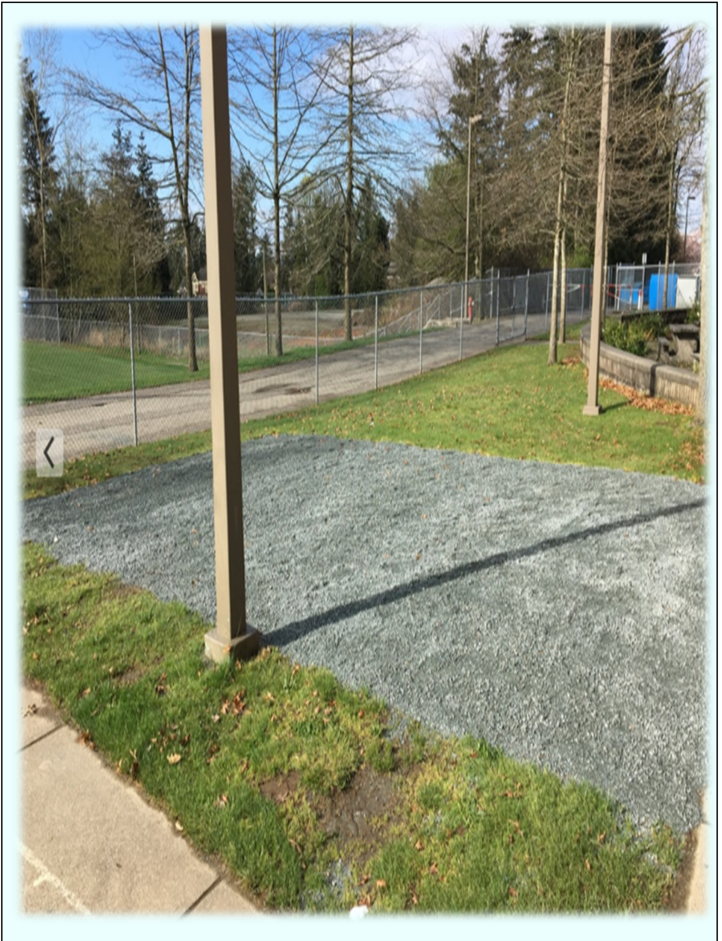
Home of Dragon Pride "Building Successful Futures"