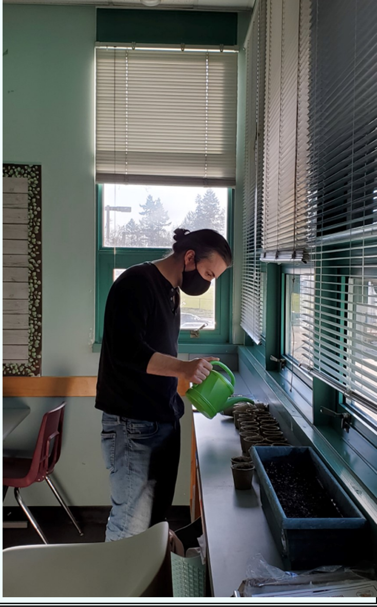
Home of Dragon Pride "Building Successful Futures"