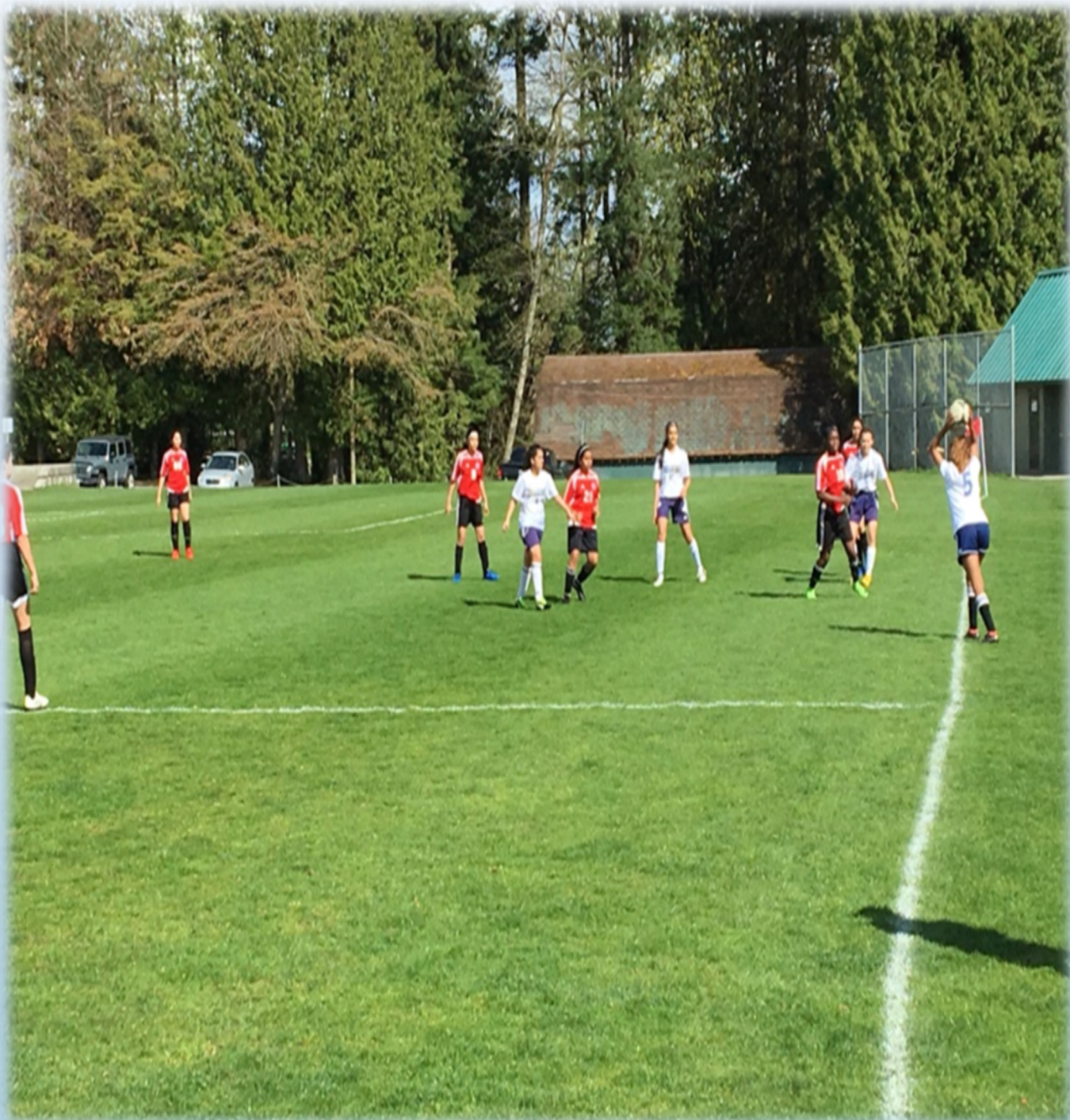
Home of Dragon Pride “Building Successful Futures”