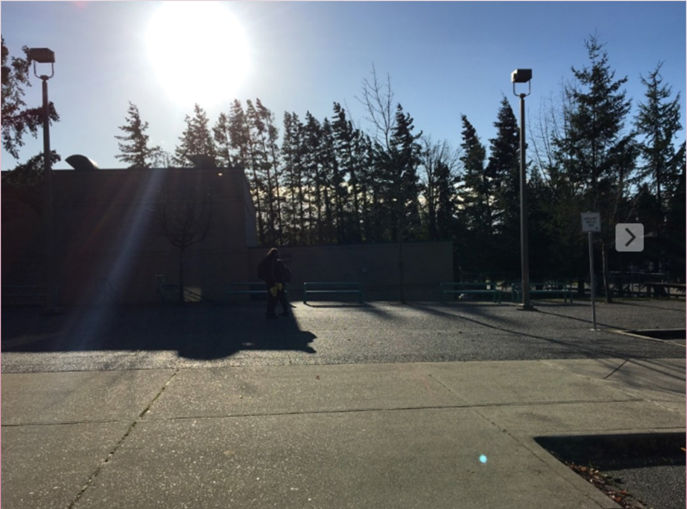
Home of Dragon Pride “Building Successful Futures”