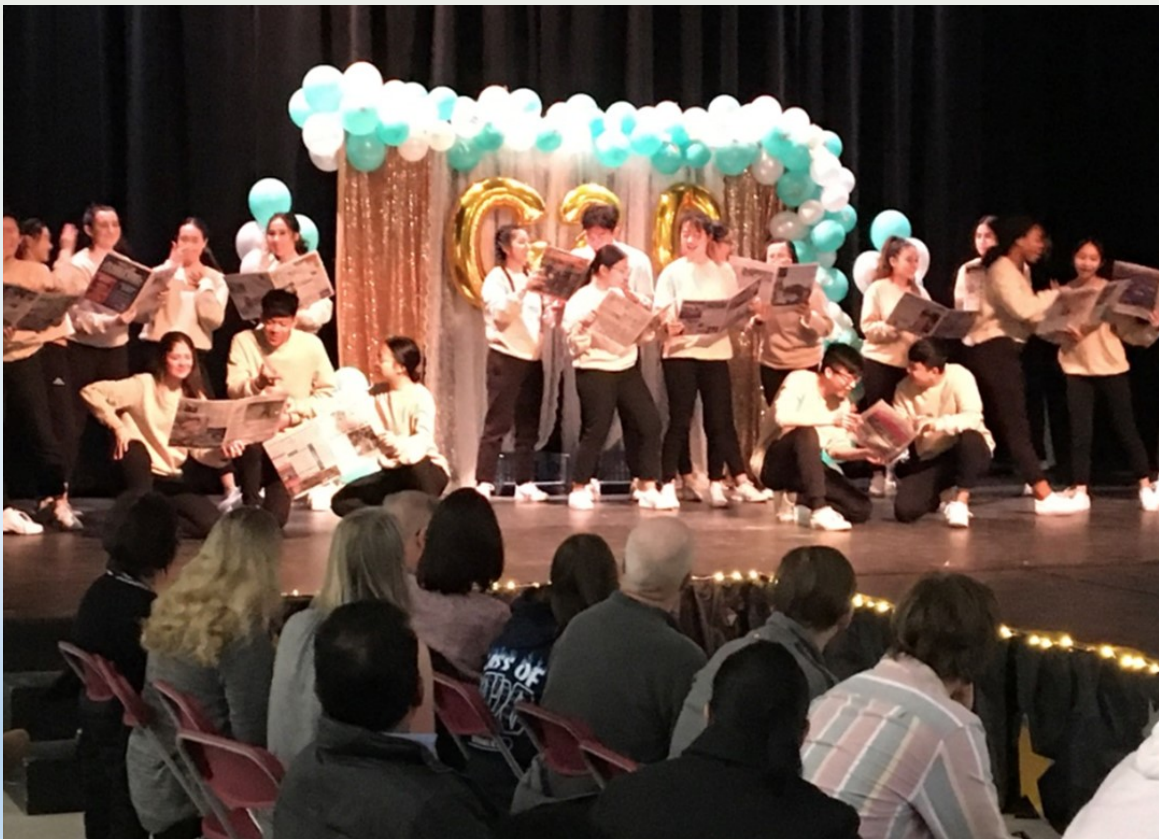
Home of Dragon Pride "Building Successful Futures"