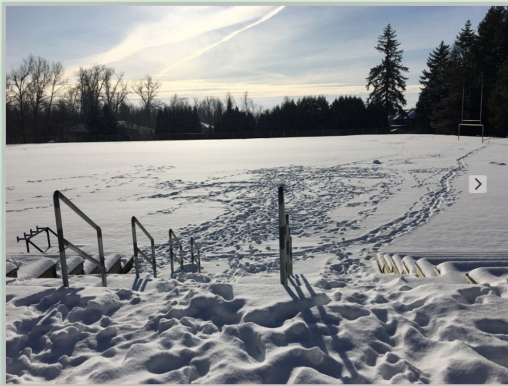
Shield's Field - Last Thursday