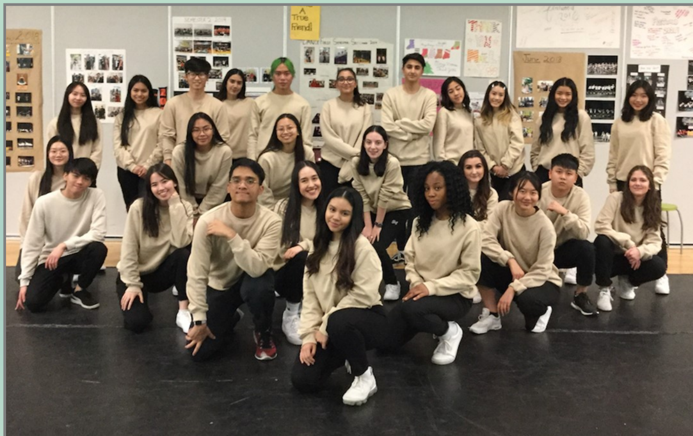
Home of Dragon Pride "Building Successful Futures"