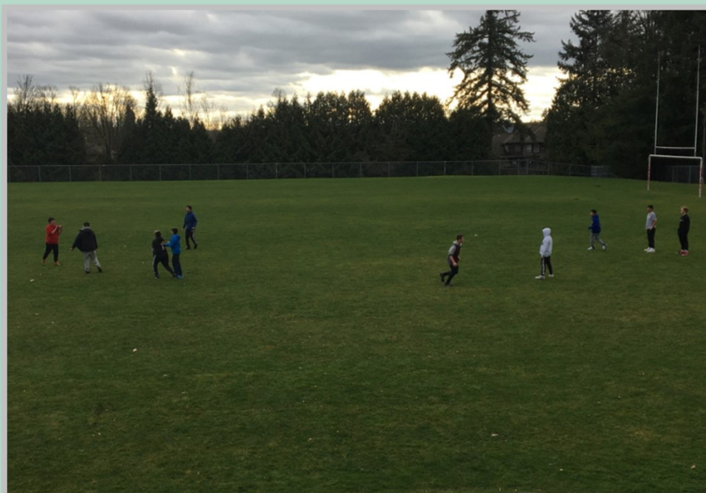
Shield's Field – This Thursday