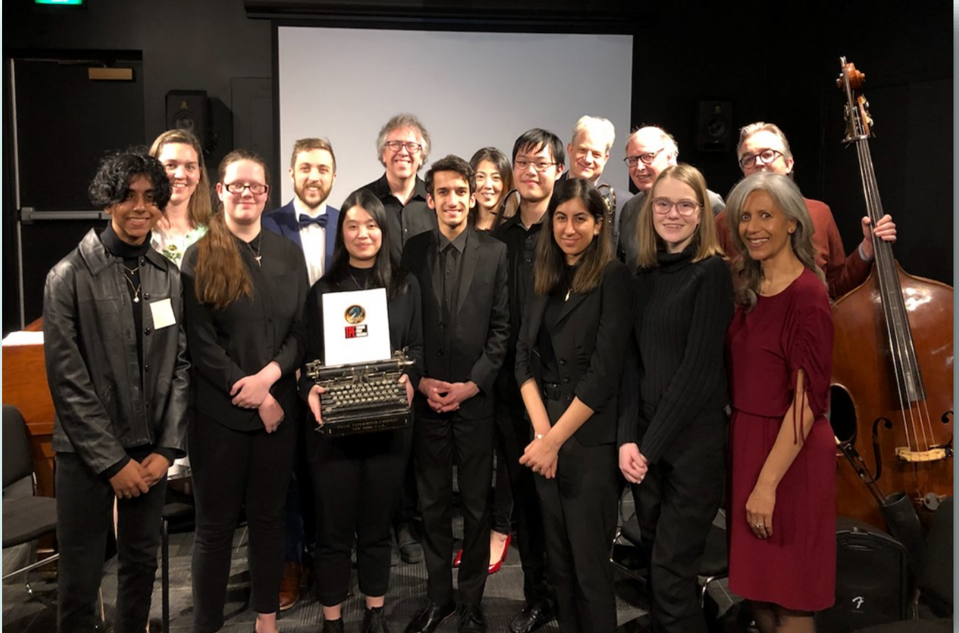
Poetry N Pieces – Canadian Music Centre