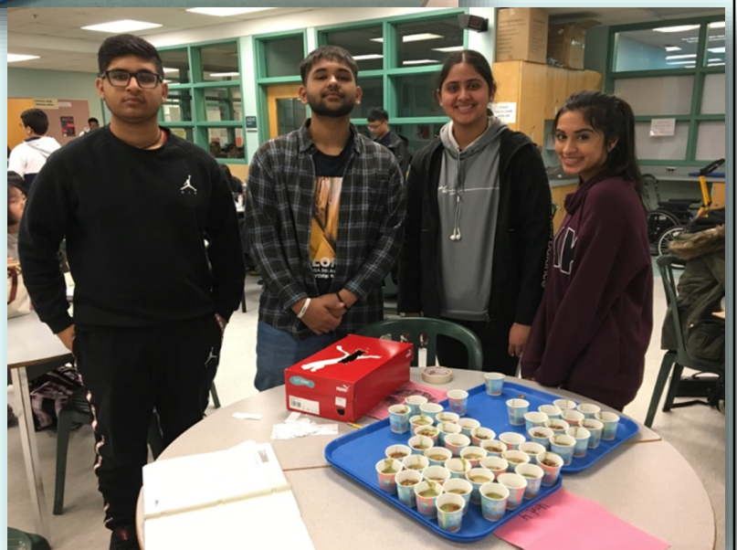
Home of Dragon Pride "Building Successful Futures"