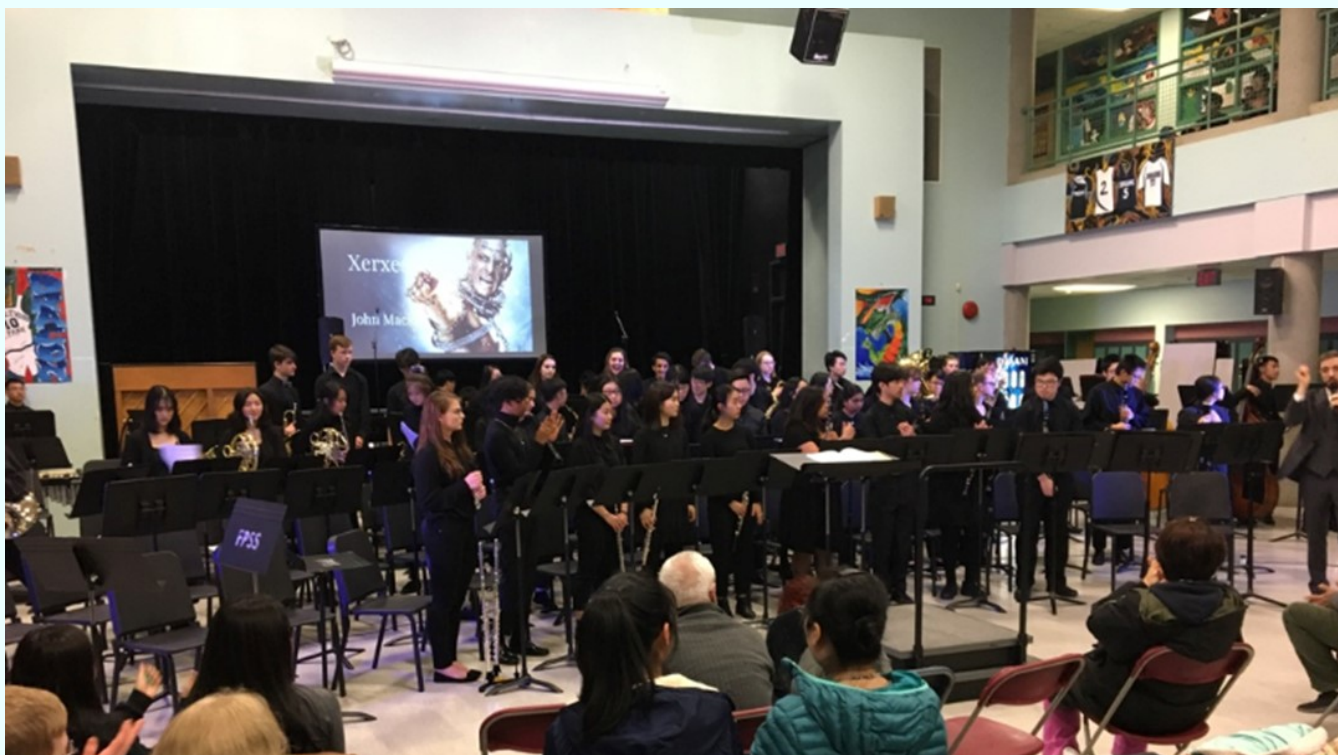
Senior Concert Band