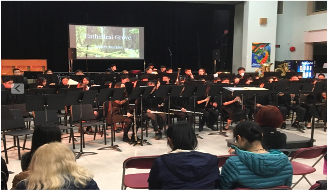
Grade 10 Concert Band