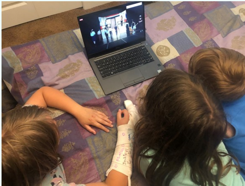
My children watching online!