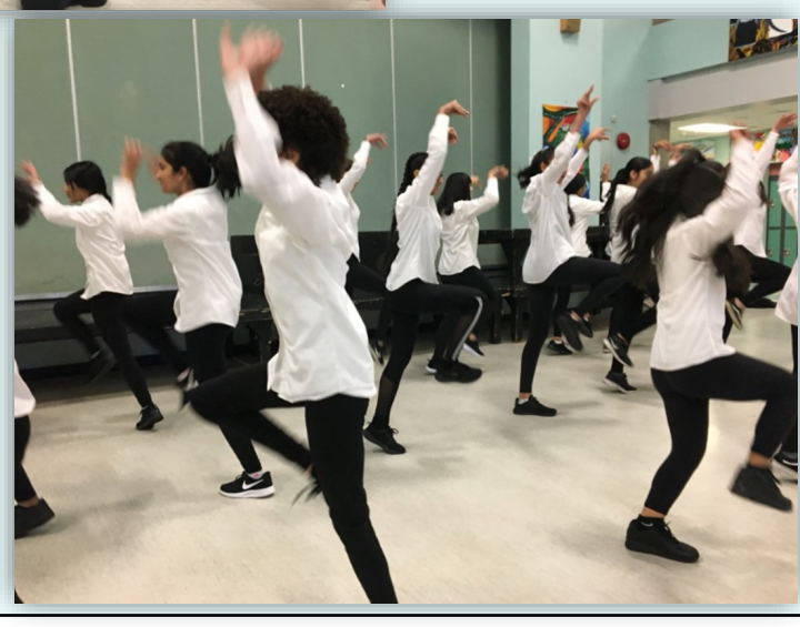
Home of Dragon Pride "Building Successful Futures"