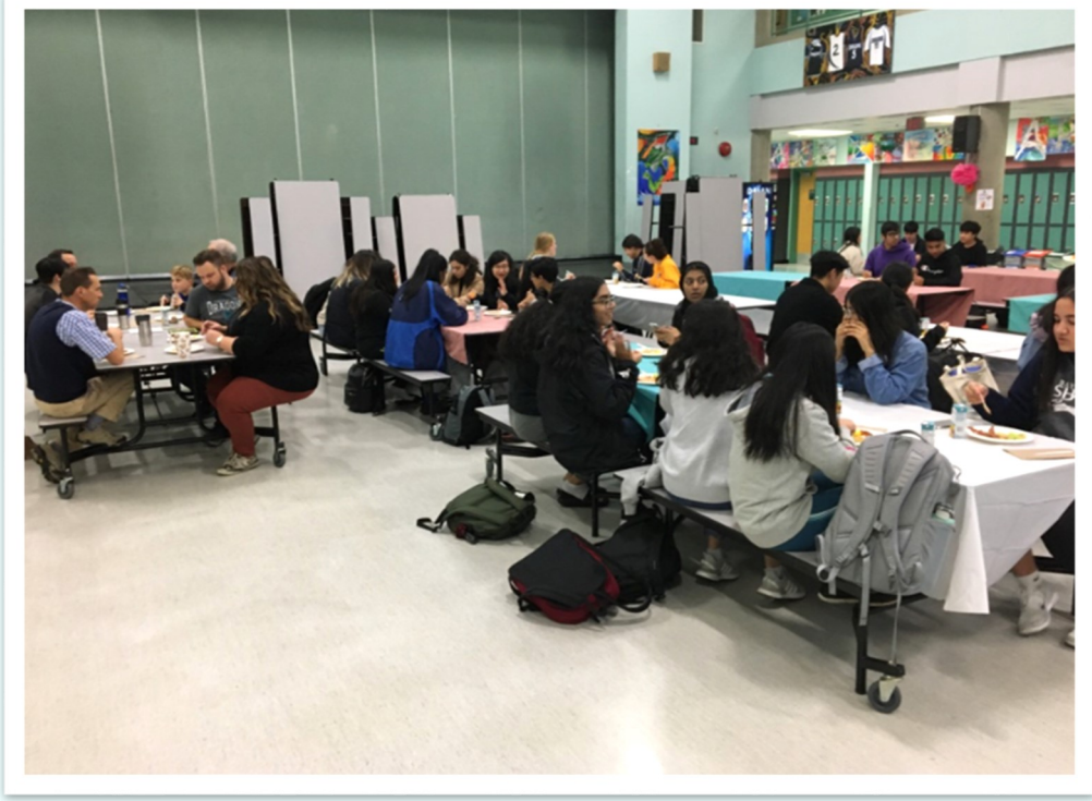
Home of Dragon Pride "Building Successful Futures"